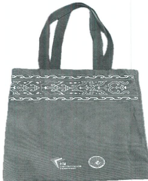
Canvas Tote Bag